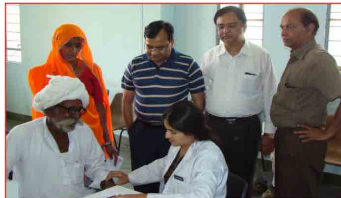
Medical camp at REIL, factory premises