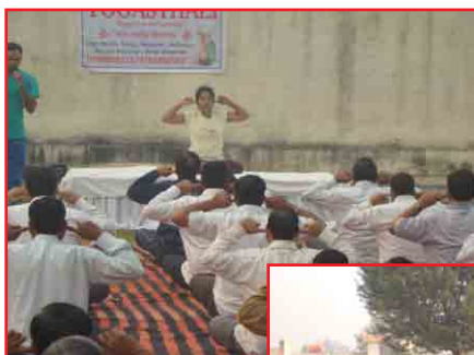
Stress Management Sessions in progress

The Company organized sessions on Yoga & Stress Management, for its employees, on 1 st November & 2 nd November, 2012, at Factory Premises.