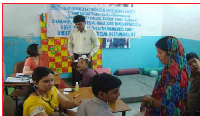
Medical camp at school