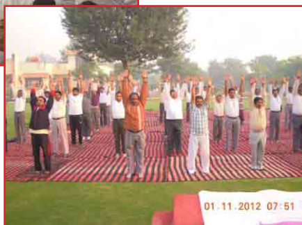
Yoga Sessions in progress